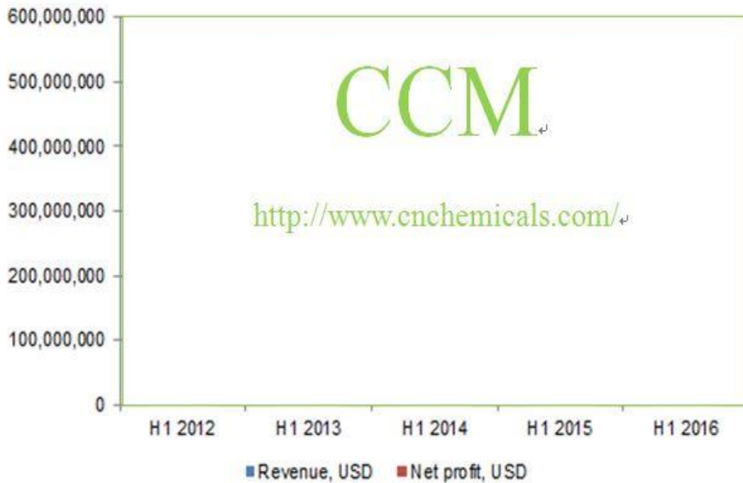
Figure 2.1-1 Revenue and net profit of Nanjing Red Sun, H1 2012-H1 2016